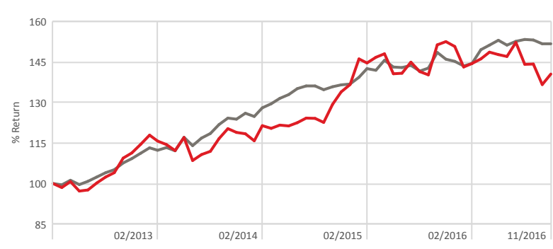
4D BCI Flexible FundBenchmark