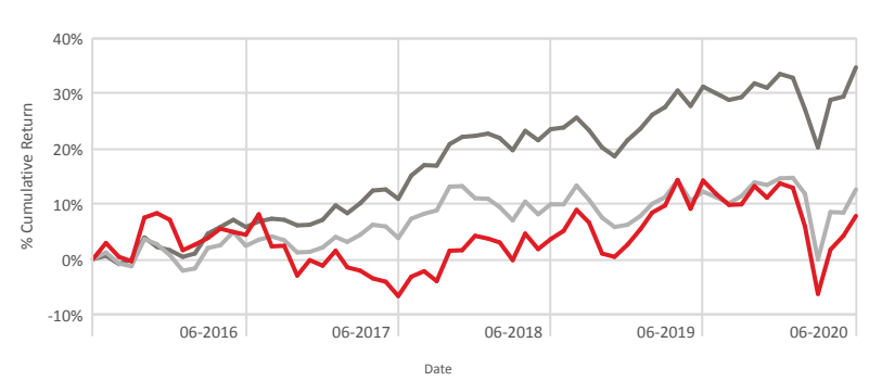
4D BCI Flexible Fund (A) Fund Benchmark