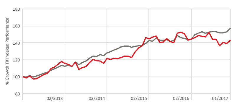
4D BCI Flexible Fund Benchmark