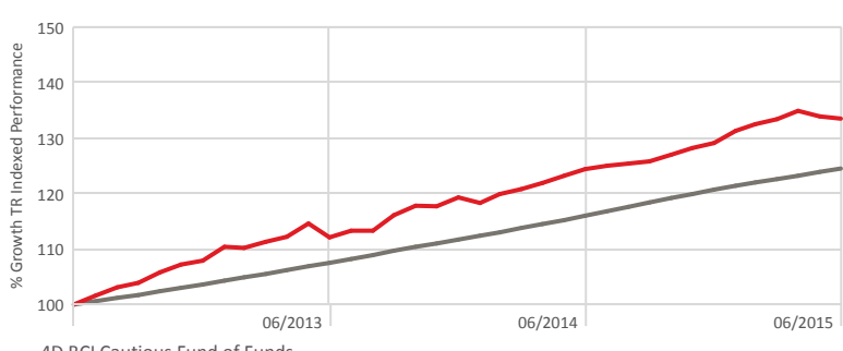
4D BCI Cautious Fund of Funds Benchmark